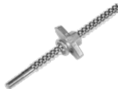
[ 3 ] Quick-clamping spindle M12