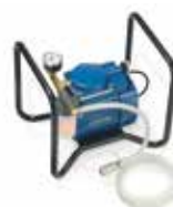
[ 7 ] Vacuum pump