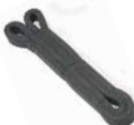
[ 5 ] Vacuum sealing ring