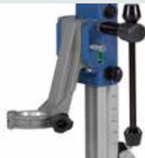
[ 2 ] Collar